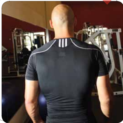
The powerful "V-back" look.

OptiMYz sat in on a recent workout at the Burnside Nubody's Fitness Centre three weeks before the World Championships. Russell called this a medium-level, maintenance workout. Note: Use the amount of weight that works safely for you.